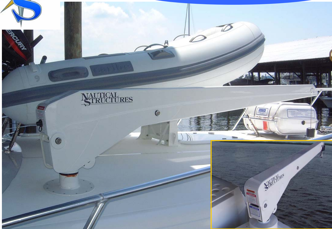
TECH HYDRAULIC DAVIT SYSTEM

TECH-1000-1-96 HYDRAULIC DAVIT SYSTEM TECH-1000-2-96 HYDRAULIC DAVIT SYSTEM